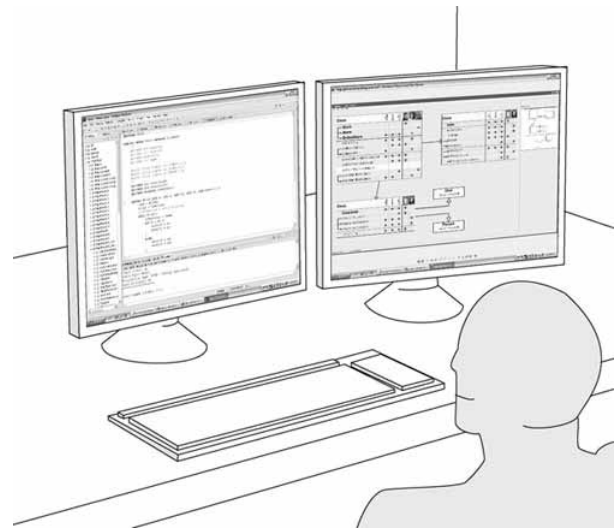
Figure 3. Side-by-Side View of Code and Emerging Design.

It is important to keep the Emerging Design view always visible, so that the developers can keep constant peripheral awareness of design changes being made by colleagues. However, in order to deal with the amount of information displayed, Lighthouse requires a dual-monitor setup, as depicted in Figure 3. With this setup, the developers can keep a side-by-side view of the code and the Emerging Design view at all times. We do not consider this a problem, but rather a great opportunity. Awareness information has always had to be restricted to fit into an existing environment. We view Lighthouse as a first pilot in which one can design the interface as on desires. The two monitor setup particularly avoids explicit context switching, which is known to be detrimental to effective insertion of awareness in an environment [8].